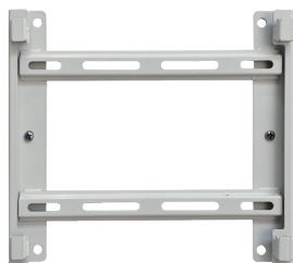
Model: LW-M5.1-Hboard Details: 3kg(Appr.)