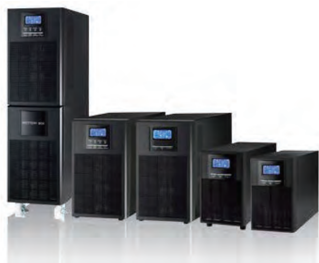
SYT6k/10k SYT6kL/10kL SYT3k SYT2k(L)/3kL SYT1k(L)