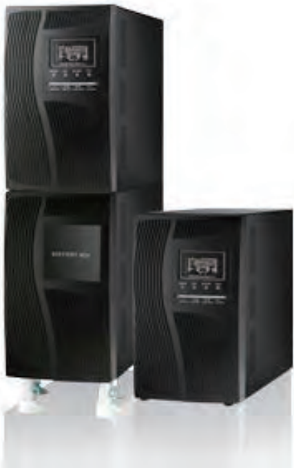
SYT6K/10K (Attachable & Expandable battery bank)