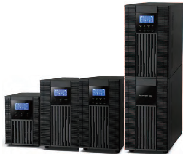
SYT1kVA SYT2/3kVA SYT6/10kVA SYT6/10kVA